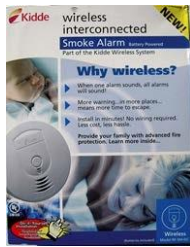
Figure 1: Interconnected smoke alarm Estimated cost $55.00 each